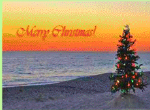
Conneaut Township Park

Conneaut Christmases Past in July from Past Conneaut Area Historical Society Newsletters