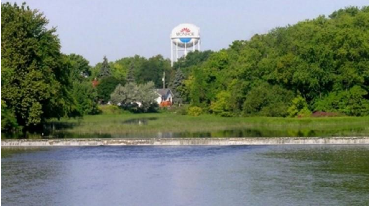
River Raisin, Monroe, Michigan