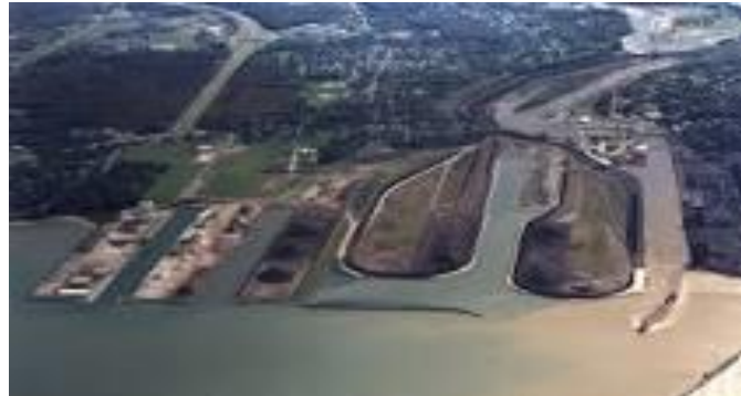
Pinney Dock Back in the Day