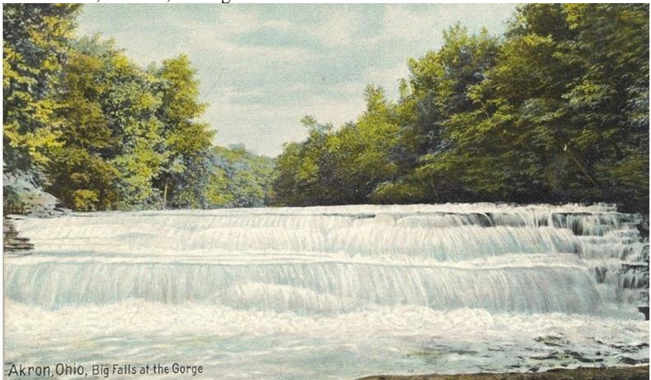
Akron, Ohio, Big Falls at the Gorge